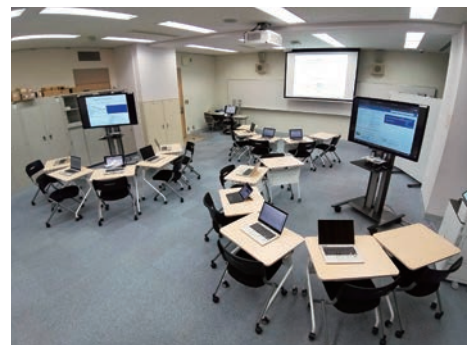
Seminar studio of IMS